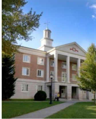
RU's Muse Hall is divided into five separate sections by floors: Muse 1 and 2, Muse 3, Muse 4 and 5, Muse 6-9 and Muse 10-13.