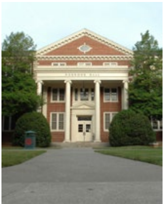
The Main Quad includes Jefferson, Madison, Tyler, Norwood, and Washington halls.