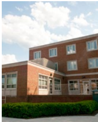
The Governor's Quad comprises Floyd, Peery, Stuart and Trinkle halls. Students must complete the Themed Housing Interest section of the housing application to be considered for assignment to a residence hall in Governor's Quad.